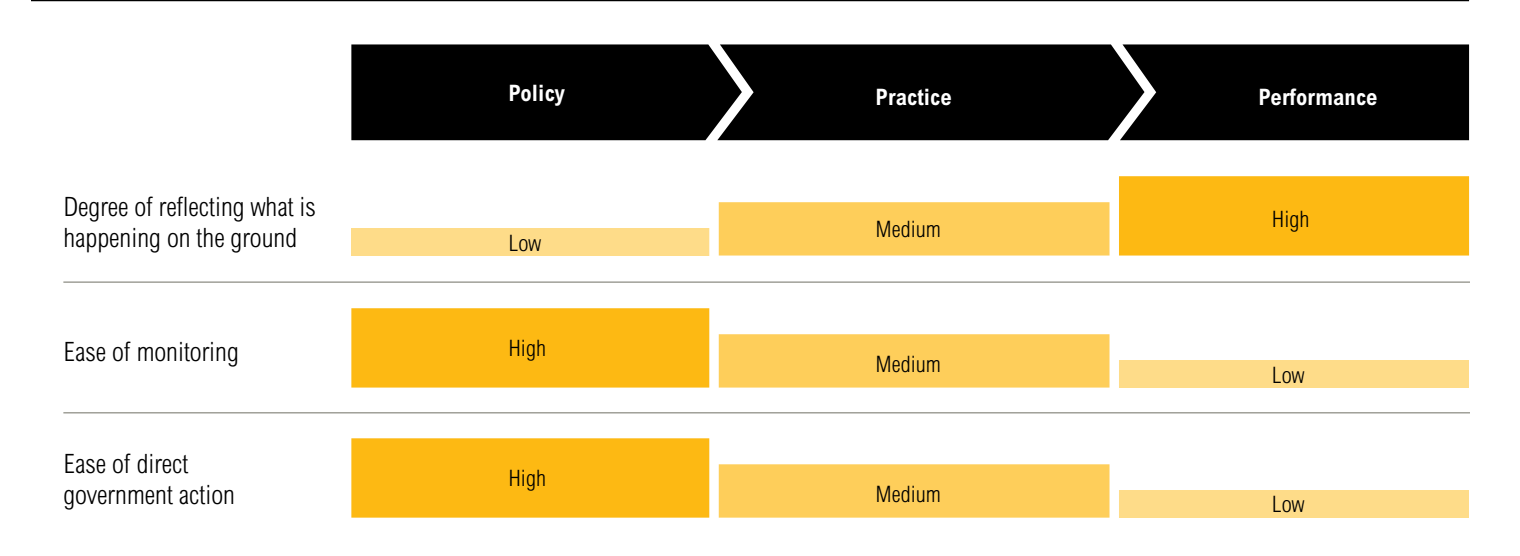
Figure 1 | Selecting Indicators of Sustainable Agriculture: Trade-offs across Steps in the Causal Chain

Trade-offs in selecting indicators along this causal chain are illustrated in Figure 1. Although performance indicators are the best reflection of what is happening on the ground because they measure biophysical conditions, they are the hardest to mandate and to monitor. Policy indicators, conversely, reflect the existence of policies, some of which may be ineffective or unenforced, but they are arguably easier to monitor than biophysical conditions.